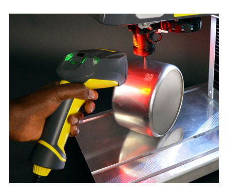
Hand-held or fixed-position scanner for code reading or checking