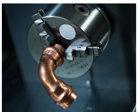
Rotary accessory for cylindrical parts marking