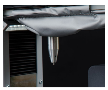
Protective bellow (optional)