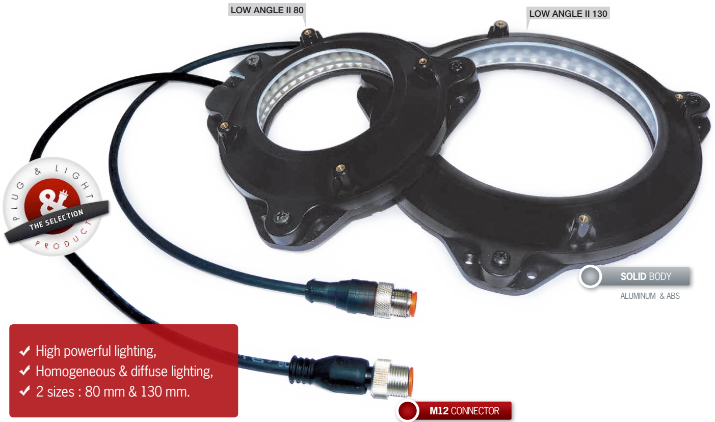
LOW ANGLE II 130